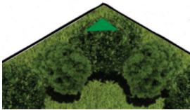
Europe Green triangles.

This Terrain tile Expansion includes Terrain tiles for: