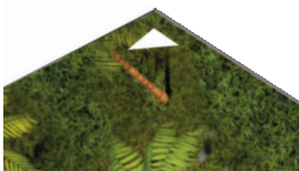
Jungle Light gray triangles.

When you gather the specified Terrain tile type at the start of a Campaign, also gather the appropriate Terrain tile types from this expansion.