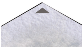
Winter Dark gray triangles.